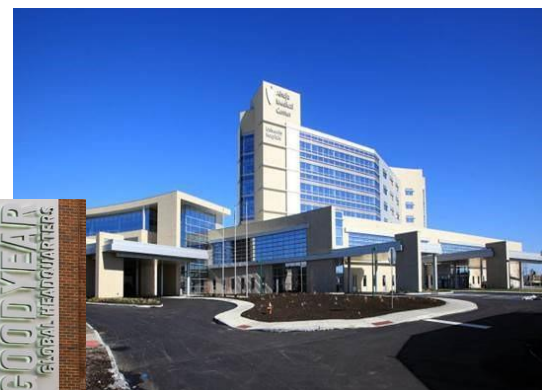
University Hospitals Ahuja Medical Center