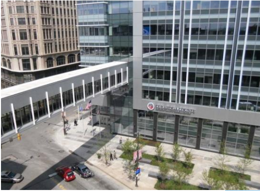
Cuyahoga County Administrative HQ