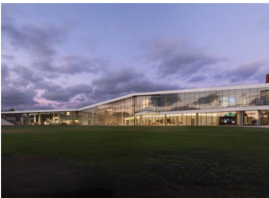
Case Western Reserve Tinkham Veale University Center

Our professionals work to exceed the expectations of our clients and focus on providing solutions to the complexities that surround a facility in transition.