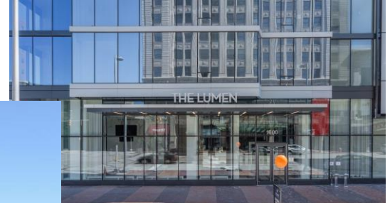
The Lumen Cleveland