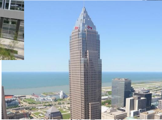
Key Bank Key Tower HQ